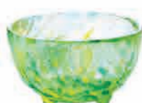
Baby Leaves F-79473