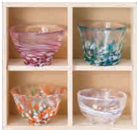
Four Seasons FS-71545