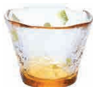
Shining in the Sky F-79468