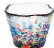
Nebuta Night Festival F-79466