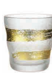
Gold Line ONE