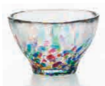
Aomori Nebuta F-71241