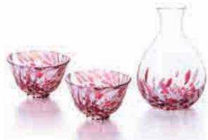
Sakura Fubuki F-71852