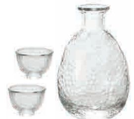
Sake Serving Set - Clear F-49092 F-49163