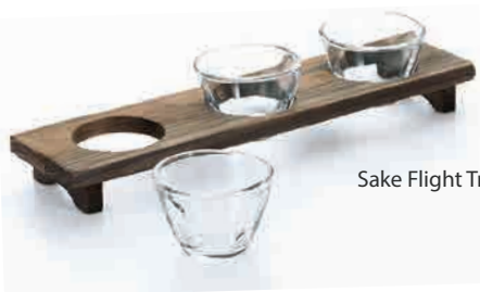
Sake Flight Tray S-5408