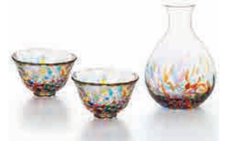
Nebuta Fire Festival F-71855