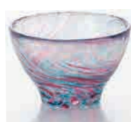
Spring Mist F-49785