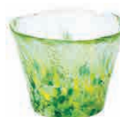
Young Leaves F-79467