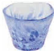
The Sea of Clouds F-79465