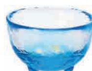
Morning Air F-79474