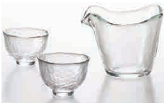
SAKE CUP SET – Sake Serving Set FS-71515