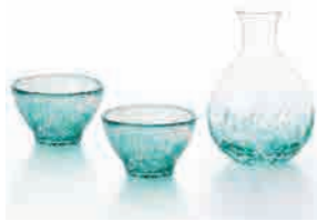
Summer Memories F-71854