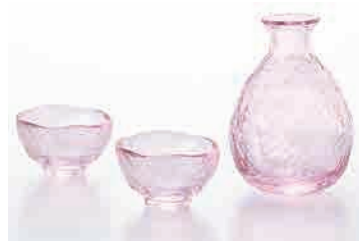
Sake Serving Set - Sakura FS-62510