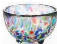
Nebuta Festival F-71905