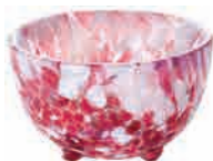
Spring Dreams F-79475