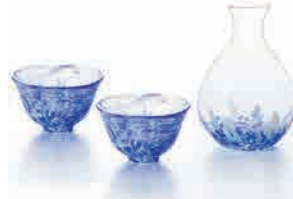
Spring Water F-71853